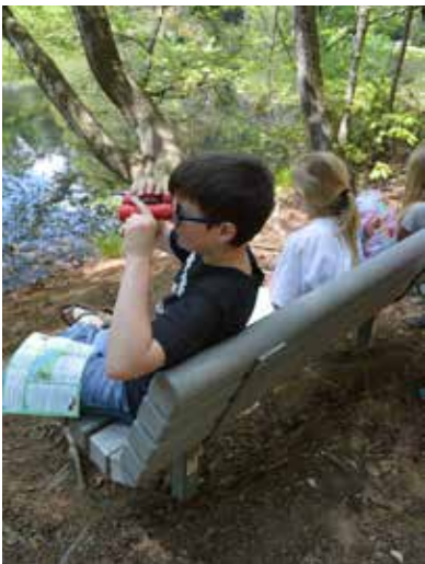
A fourth grade student uses binoculars to make observations about Front Lake's ecosystem.

Citizen Science is a new approach to data collection that enlists the public's help in making observations and taking readings for studies and research. With the new trail, children and families can get in on the action. Kids use a new brochure to locate marked stations around the lake, where they perform observations and experiments such as taking air and water temperature readings and measuring the pH of the lake. In addition to helping researchers, children learn new skills related to environmental science, connecting the dots between outdoor adventures and protecting natural resources.