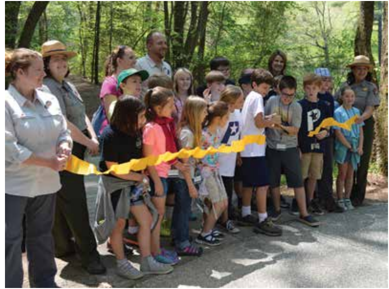
Children at Carl Sandburg cut the ribbon on a new Citizen Science TRACK Trail.

the Carl Sandburg staff by registering their scientific journey at kidsinparks.com . Scientists from the park can then download the data and monitor the health of the lake over time.