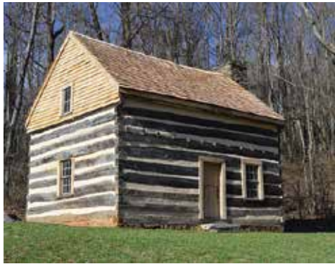
Historic Polly Woods Ordinary

Three Foundation projects have been completed in the