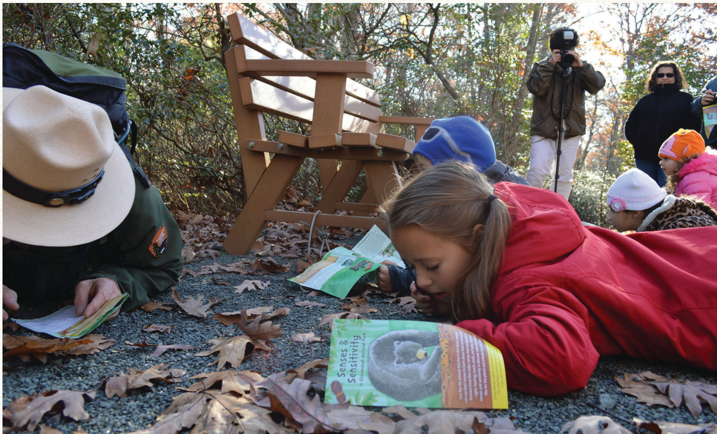
Children learn how box turtles see the world during a TRACK Trail hike.

Spring weekends and summer vacation are the perfect time to introduce kids to the outdoors, and we have a great way to do it: TRACK Trails. Our Kids in Parks program is nationwide, but there are nine trails along the Blue Ridge Parkway waiting to be explored. The adventures are easy and fun. Just pick up an activity guide at the trailhead kiosk, and start a trek. After the outing, be sure to register your visit at kidsinparks.com and start collecting free prizes!