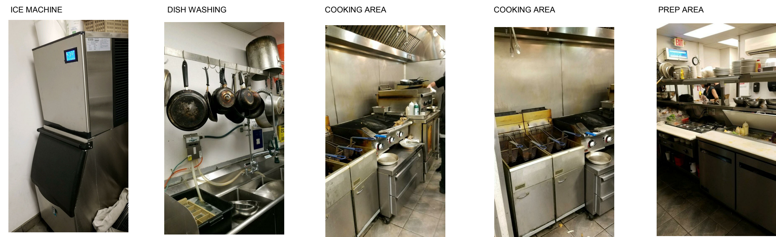
2 KITCHEN STATION - SAMPLES 1" = 1'-0"