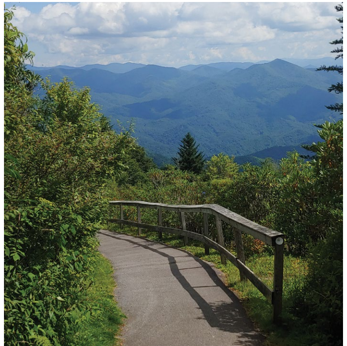
Land near Waterrock Knob will be surveyed.

Your gift can provide trail maps for areas including Julian Price Park (below).