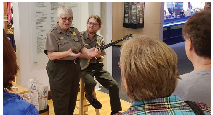
Top: Chatham Rabbits perform. Above: Rangers share the history of mountain music with visitors at the Roots of American Music Museum.

Light up the stage with your generosity! Last year, a lightning strike damaged the amphitheater's lighting console and processing unit. In addition to illuminating a stellar slate of talented performers, the new system will pave the way toward replacing old fashioned, high-wattage bulbs with low-voltage LED bulbs that will be more energy efficient and better for the environment.