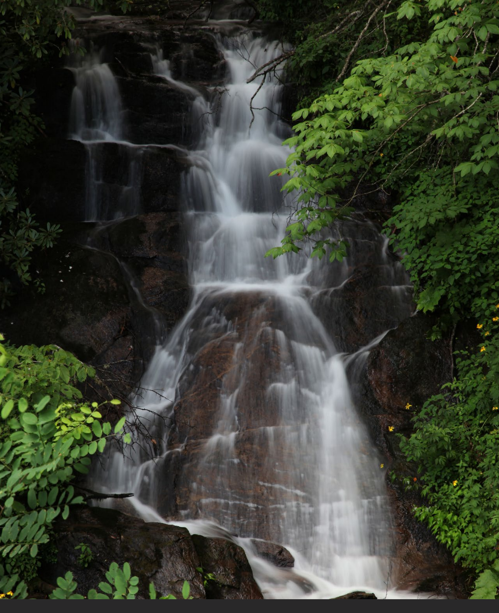
Front cover: Blue Ridge Parkway near Thunder Hill Overlook, Milepost 290.4. Back cover: Woodfin Cascades Overlook, Milepost 446.7.