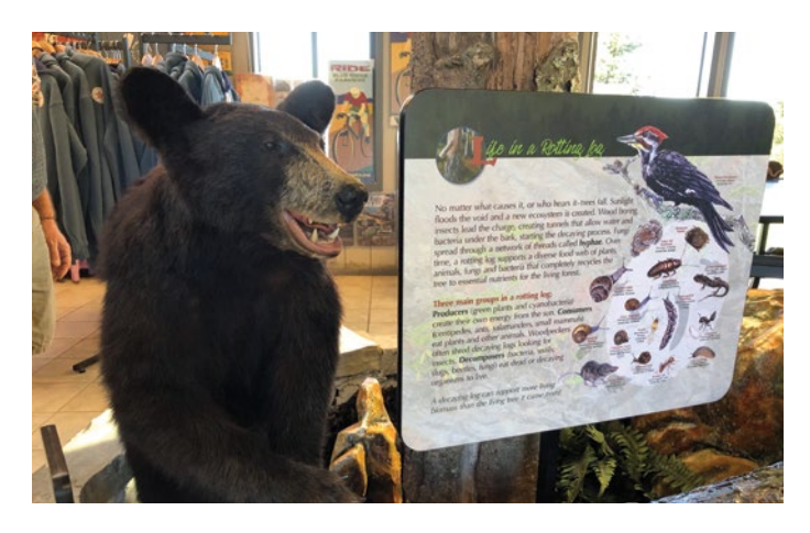
New exhibits replaced the aging & outdated displays.

A new 12-foot mural illustrates a multi-seasonal peek at unique flora and fauna of this high elevation environment, as well as the surrounding geological features. Another panel tells the Cherokee story of "How the World was Made," which describes the buzzard creating the peaks and valleys with its wings, in both Cherokee syllabary and English.