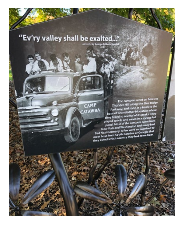
One panel of the new display highlights outdoor activities at Camp Catawba.

The Waterrock Knob Visitor Center is closed for the winter, but the new exhibits will be available to visit again in spring of 2022.