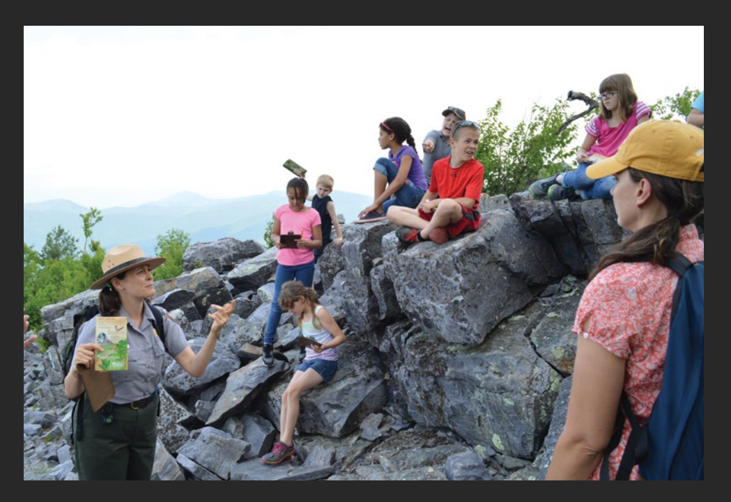
A Park Ranger leads kids in TRACK Trail activities.

To try out e-Adventures, or to find a TRACK Trail near you, visit KidsinParks.com.