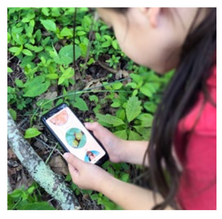
A Trail TRACKer identifies lichens as part of the Hide and Seek e-Adventure.

"People are beginning to realize, or at least