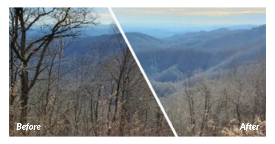
The Lump Overlook, milepost 264.4

been a 50 percent decrease year-over-year in search and rescue calls on federal land in the county. It is a great example of the power of partnerships, having helped hikers stay safe while freeing up emergency responders for the many demands of their critical jobs.