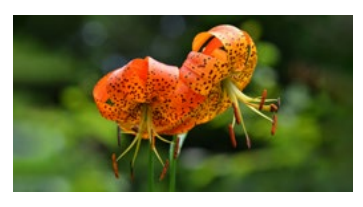
Carolina Lily.

Blue Ridge Parkway Foundation 717 S. Marshall St., Suite 105B Winston-Salem, NC 27101 Tax ID: 31-1512730