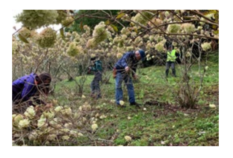
To give your time to improving the Parkway, visit BRPFoundation.org/volunteer.

In another, the hydrangea gardens at Bass Lake received much needed TLC after the volunteers were taught to properly prune and care for the plants. The group cut back dead wood and discussed how to trim them in the spring so that these 100-year-old specimens will remain healthy and full of blooms.