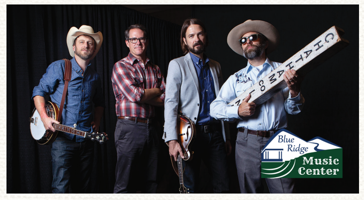
Chatham County Line

July 20 The Steel Wheels | $20 adults, $10 children