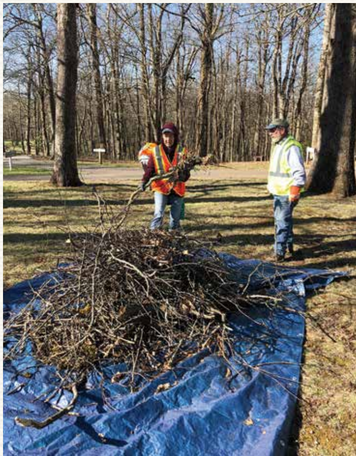
Volunteers cleared fallen limbs at Crabtree Falls Campground near Sparta, North Carolina. Left: National Park Service employees and volunteers get ready to work.