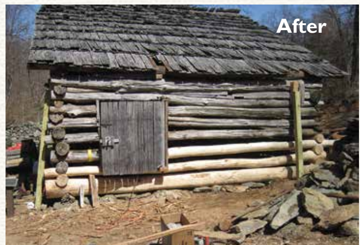
Hand-peeled and notched logs were used to shore up the barn after poor drainage caused the timbers to rot.