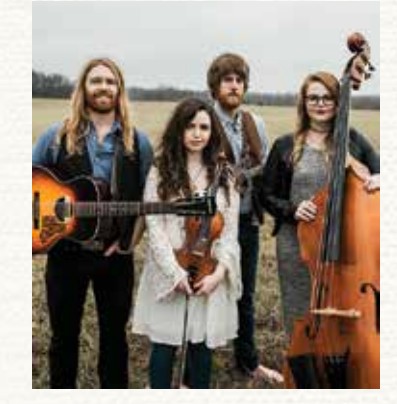
The Barefoot Movement

Tickets are available at blueridgemusiccenter.org.