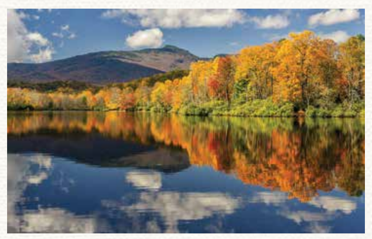
Fall photography tip: The views from the mountain peaks are breathtaking, but be sure to stop at lakes too. Reflections of trees on the water create gorgeous scenes for pictures.

Sleep Under the Stars: The campgrounds in the park close for the season on October 28, but you can still enjoy a crisp evening under the stars at Explore Park (milepost 115 at Roanoke). The park recently added primitive sites, yurts, tepees, canvas tents, and pod cabins for overnight stays. To make reservations, visit roanokecountyparks.com