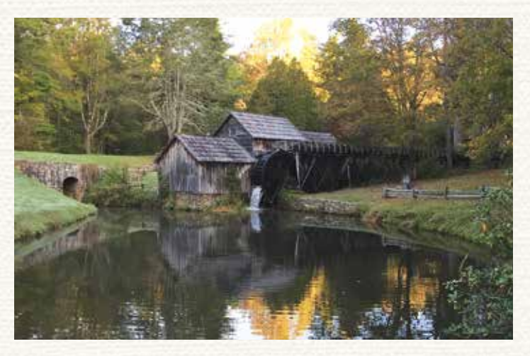
To keep the recently replaced waterwheel turning at Mabry Mill, the leaking flume must be repaired.

Each of these specially selected locations tells a story about our mountains. Humpback Rocks Farm illustrates the tough but rewarding life of pioneers. Sharp Top Shelter at Peaks of Otter is a testament to the adventurous spirit of those who trekked to the summit long before a road reached the top. As the