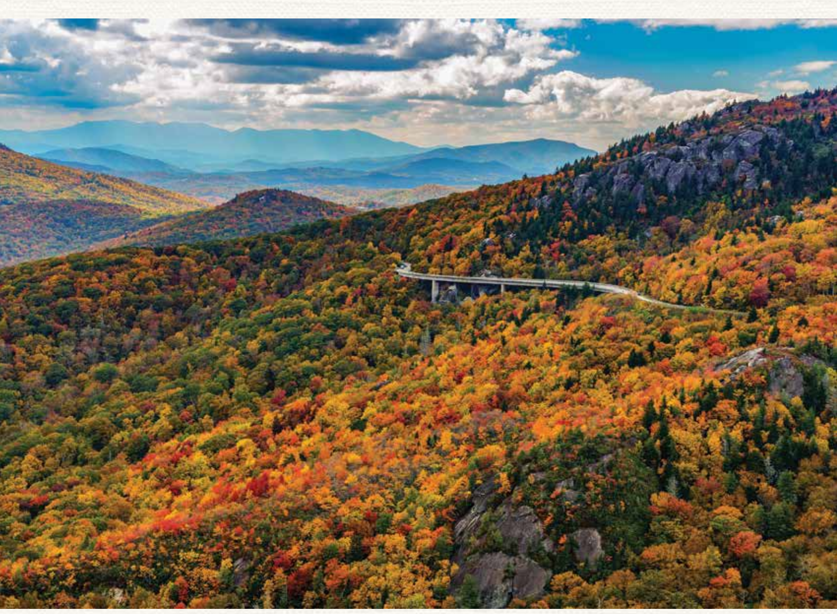
Autumn paints the mountains surrounding the Linn Cove Viaduct in red, amber, and gold.

Blue Ridge Parkway Foundation - Fall 2017