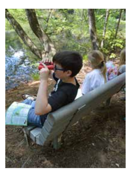
A fourth grade student uses binoculars to make observations about Front Lake's ecosystem.

Citizen Science is a new approach to data collection that enlists the public's help in making observations and taking readings for studies and research. With the new trail, children and families can get in on the action. Kids use a new brochure to locate marked stations around the lake, where they perform observations and experiments such as taking air and water temperature readings and measuring the pH of the lake. In addition to helping researchers, children learn new skills related to environmental science, connecting the dots between outdoor adventures and protecting natural resources.