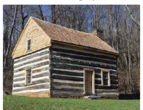
Historic Polly Woods Ordinary

Three Foundation projects have been completed in the