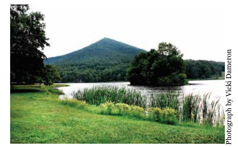
Sharp Top Mountain and Abbott Lake

Peaks of Otter is made up of Flat Top, Sharp Top, and