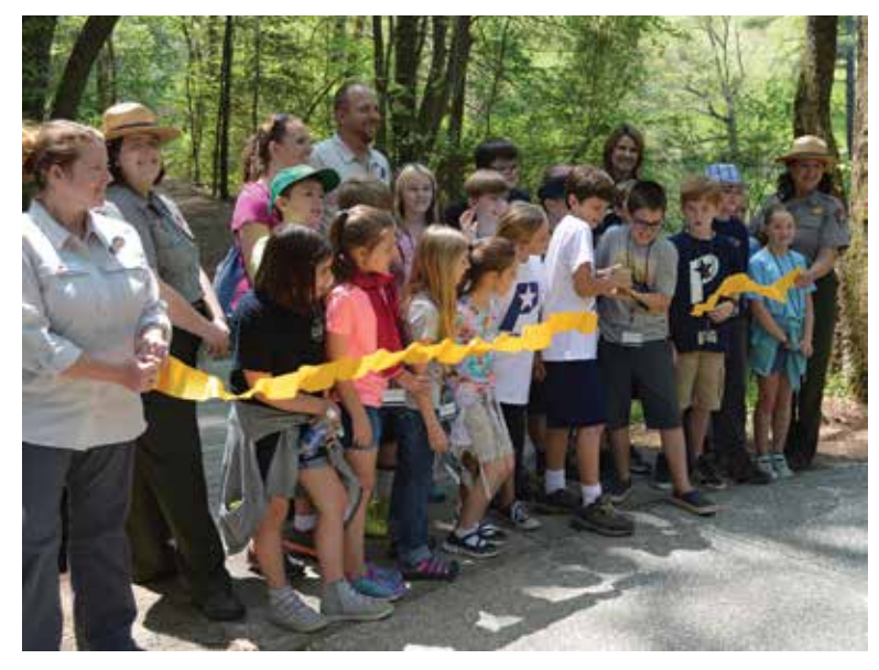
Children at Carl Sandburg cut the ribbon on a new Citizen Science TRACK Trail.

the Carl Sandburg staff by registering their scientific journey at kidsinparks.com. Scientists from the park can then download the data and monitor the health of the lake over time.