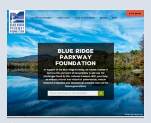
Our new website is easy to use and responsive to mobile devices.

Events: Mark your calendar for exciting Foundation events! Blog: Our new blog is a hub for Parkway news, project updates, history flashbacks, and tales from the road.